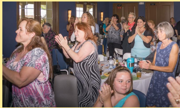
2015 Day of Hope guests

Please save the date for our third annual "A Day of Hope" on Saturday, April 23, 2016.